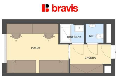
1+kk, Domych, Brno-střed